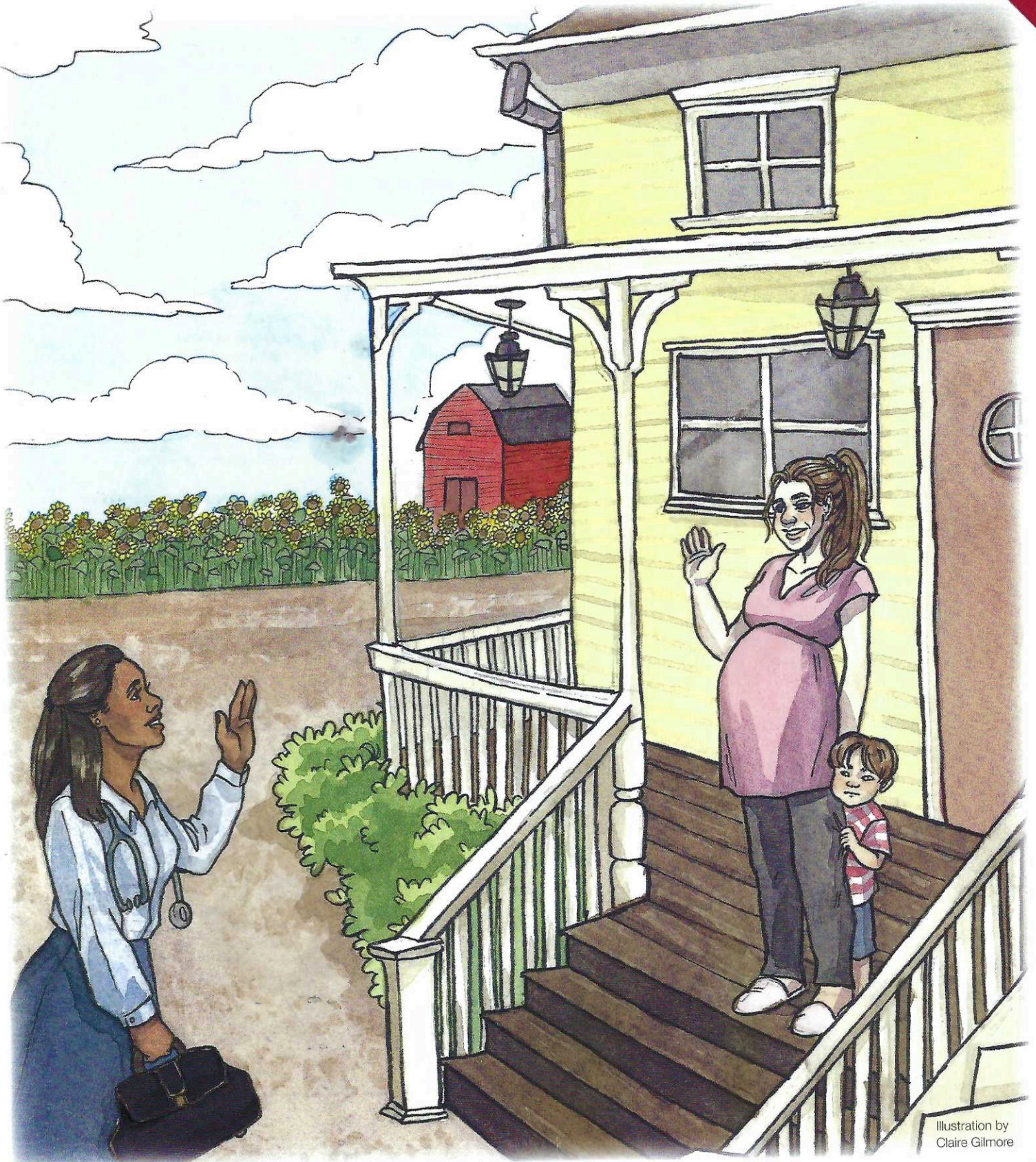
Illustration by Claire Gilmore